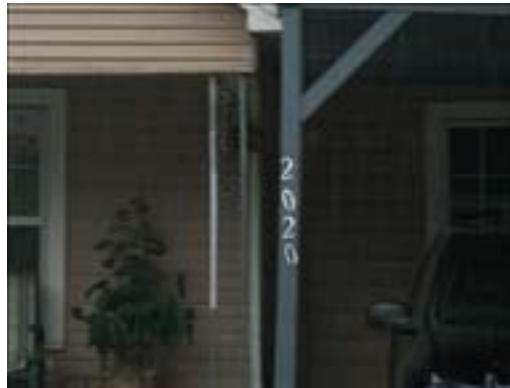
Street Scene Left Photo