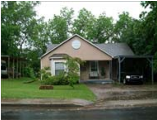
Address Verification Photo